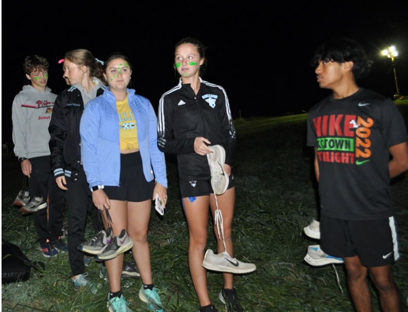
After the races, the Collins' athletes prepare to throw their old shoes in the vaunted "shoe tree" on the Lavern Gibson Championship Course.